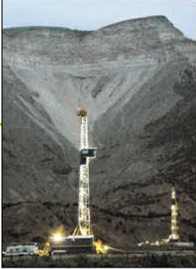
Post file photo